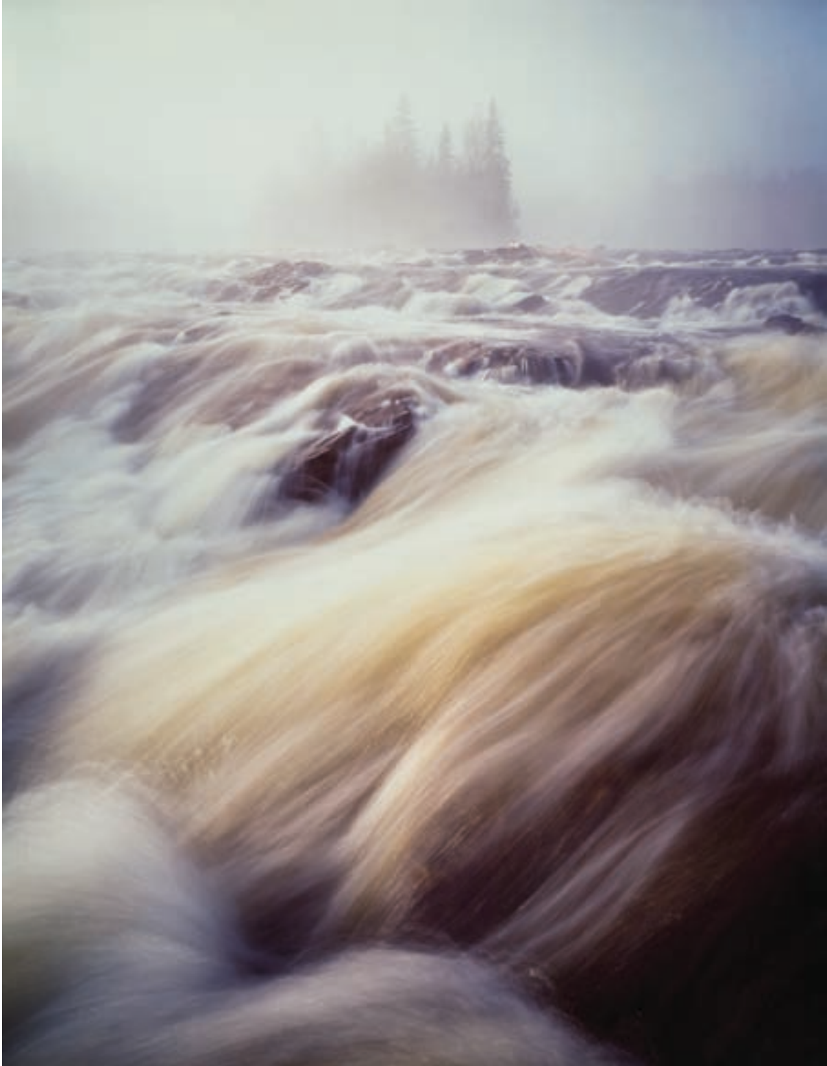
Wings of Light (30"x40" Ilfochrome) - Ebony SV45U2, Schneider Super-Symmar XL 80mm/4.5, Fuji Velvia 50. Exposure 1/15.

For hours, I watched the distant island of trees appear and recede in the continuous ebb and flow from the shifting veil of mist, as the cool monochromatic scene slowly gave way to the dawn of a new day. Suddenly, the powerful rays from the rising sun diffused with the hazy landscape, and, for a brief moment, transformed the cascading water before me into a beautiful ribbon of gold as the moment was captured on film. As quickly as it appeared, the subtle radiant glow and haunting mist were lost to the intensifying sun, instantly reverting the once outer-worldly scene back to that of the mundane.