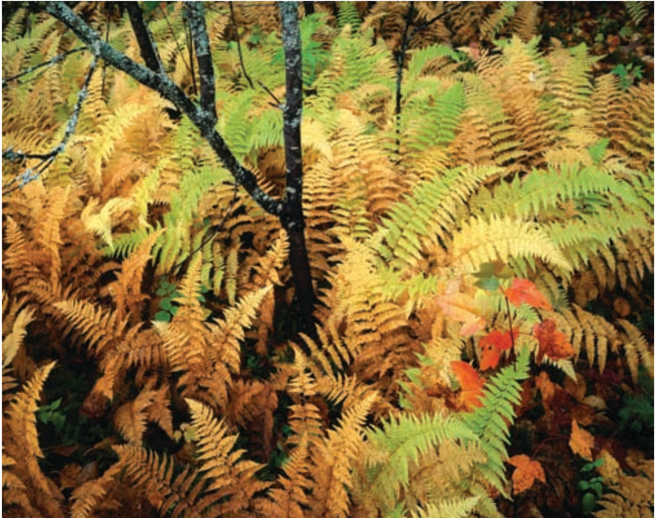
Ferns in Autumn (30"x40" Ilfochrome) - Ebony SV45U2, Schneider Super-Symmar 110mm/5.6, Fuji Velvia 50.

Not long after I began using the large format wood camera, I developed a new way of seeing. I began to turn my eye toward the more delicate and intimate landscapes often overlooked, knowing that the large negative would portray even the most diminutive detail with utmost clarity. While traveling through La Maurice National Park in Quebec, a cluster of colored foliage at the side of the road caught my eye. I pulled over to find this lively grouping of ferns in autumn colors, and carefully selected a composition that would best communicate the scene onto film.