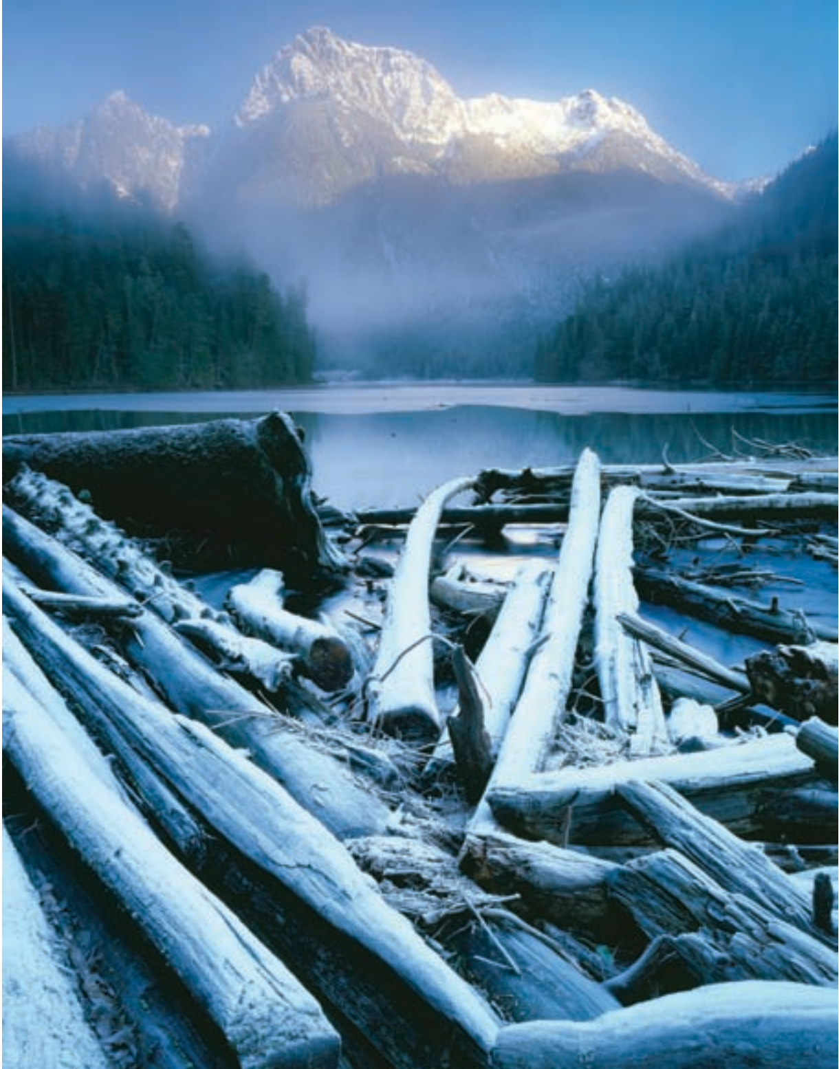
Schoen Lake in Winter (30" x 40" Ilfochrome) - Ebony SV45U2, Schneider Super-Symmar 110mm/5.6, Fuji Velvia 50.

It was a cold December morning when I made the journey to Northern Vancouver Island to photograph the frigid shoreline of Schoen Lake. Leaving the camera set up for the entire day, I patiently waited for the last light and enveloping fog to capture my first successful 4x5 image.